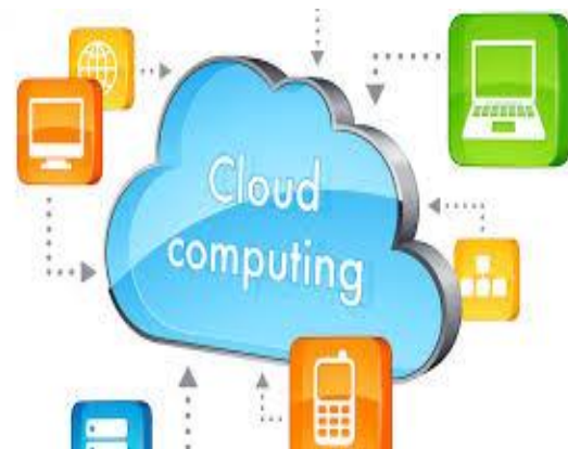
Fig 1: Cloud Computing

Proponents claim that cloud computing allows companies to avoid upfront infrastructure costs, and focus on projects that differentiate their businesses instead of on infrastructure. Proponents also claim that cloud computing allows enterprises to get their applications up and running faster, with improved manageability and less maintenance, and enables IT to more rapidly adjust resources to meet fluctuating and unpredictable business demand. [2][3][4] Cloud providers typically use a "pay as you go" model. This can lead to unexpectedly high charges if administrators do not adapt to the cloud pricing model.