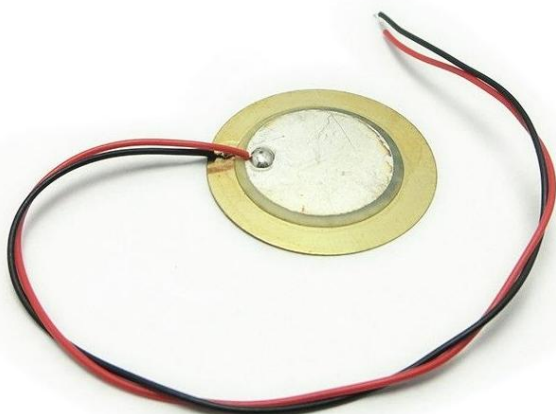
Fig:4 Piezo disk sensor

Usually, a piezo-disk is used for vibration detection and is little expensive as a module. But, in this project we have used such disk by breaking a buzzer. We removed a piezo-disk from it and connecting wires are drawn from its insulating material. Such an assembly provides analog output with high sensitivity. This analog output is used as an input to the Arduino system, and later to determine threshold of the accident.