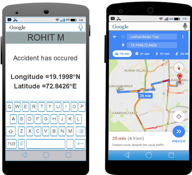
Fig:6 Experimental result

Latitude and Longitude are the units that represent the coordinates at geographic coordinate system. Just like every actual house has its address (which includes the number, the name of the street, city, etc), every single point on the surface of earth can be specified by the latitude and longitude coordinates. Therefore, by using latitude and longitude we can specify virtually any point on earth.