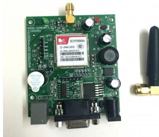
Fig:2 Sim 808

usually a better option for commercial purposes such as fleet tracking or monitoring of people, such as children or elderly, as it allows a caregiver to know exactly where loved ones are, whether they are on time and whether they are where they are supposed to be during a journey. This is also a useful way of monitoring the behavior of employees as they carry out their work and of streamlining internal processes and procedures for delivery fleets [9].